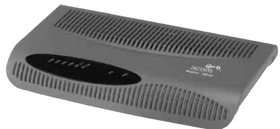
3Com Router 3030

The DSL routers interoperate with a broad range of international standard DSL equipment (depending on model): ITU-T 992.1 (G.DMT, Annex A and B), ITU-T G991.2, ITU-T 992.2 (G.Lite), ITU G.992.3 (ADSL2), ITU G.992.5 (ADSL2+), ITU-T 994.1 (G.handshake) and ANSI T1.413 Issue 2 specifications. The G.SHDSL models accommodate symmetric DSL speeds up to 2.3 Mbps over single-pair-wires, or 4.6 Mbps over two-pair wires.