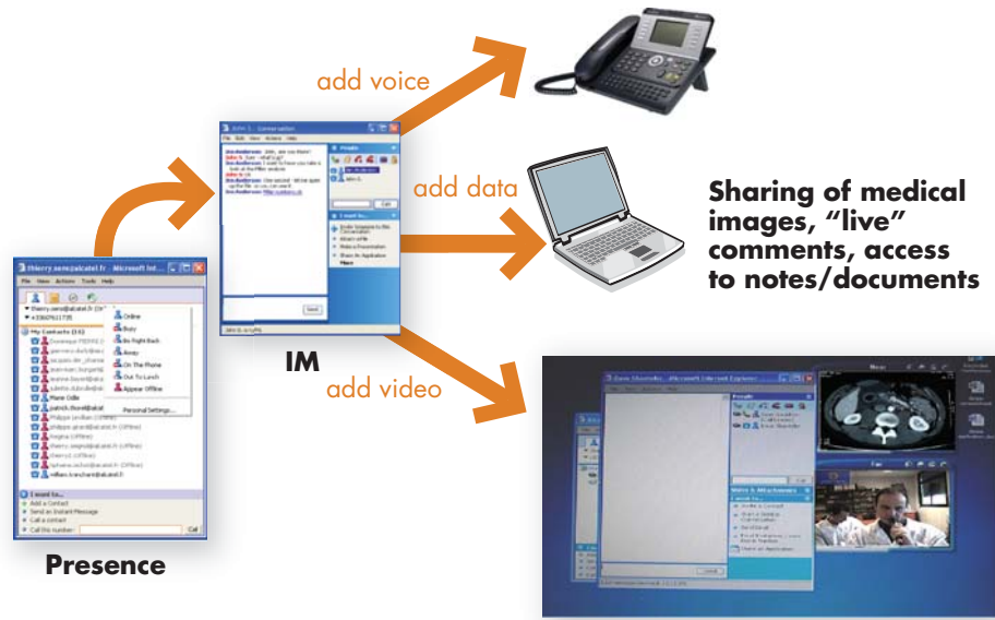
Figure 2: "My Teamwork" applications facilitate collaboration

"Having a standards-based solution that would deliver a seamless network became key in our review of vendors, and proved to be a wise decision."